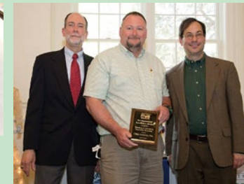
The Morris County Municipal Utilities Authority, which promotes environmental conservation, recognized Casio America's efforts with an award for excellent recycling programs within large businesses.