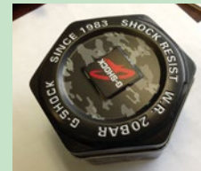
Watch packaging and display materials that use recycled materials

Casio America has been conducting various environmental conservation activities for many years. Activities include collecting and sorting bottles and cans for recycling, collecting paper and cardboard for delivery to recycling centers, using recycled materials for watch packaging and display materials, replacing personal computers that used a large amount of electricity, and providing drinking bottles to employees to reduce the use of paper cups.