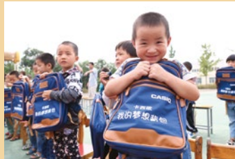
Children with their new rucksacks

Casio China plans to support the growth and education of children through the My Dream Rucksack charity program in keeping with the concept of "Creativity and Contribution."