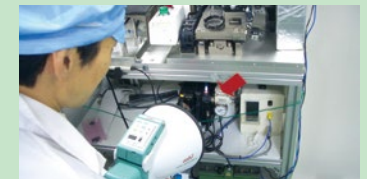
Air leakage is measured at designated checkpoints

Yamagata Casio was selected for the Excellent Work Site Commendation for activities that included reducing the amount of air used to drive machine tools and automatic machinery and remove dust from components, and for constructing a power monitoring system. Yamagata Casio will continue to proactively reduce energy use.