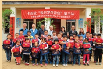
A group of children with their new rucksacks