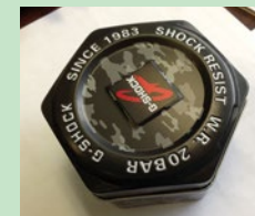
Watch packaging and display materials that use recycled materials

Casio America has been conducting various environmental conservation activities for many years. Activities include collecting and sorting bottles and cans for recycling, collecting paper and cardboard for delivery to recycling centers, using recycled materials for watch packaging and display materials, replacing personal computers that used a large amount of electricity, and providing drinking bottles to employees to reduce the use of paper cups.