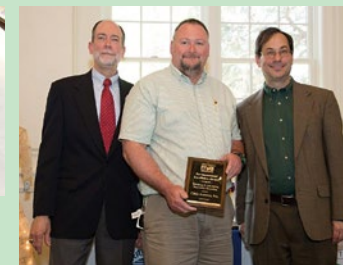
The Morris County Municipal Utilities Authority, which promotes environmental conservation, recognized Casio America's efforts with an award for excellent recycling programs within large businesses.